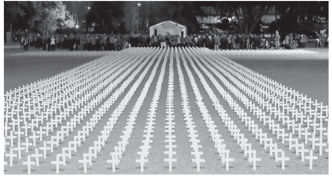
3,300 crosses representing 165,000 unborn children deprived of life since 1998

During the Rally service, the CDHL presented William Wilberforce Awards to Members of Parliament with a long-term