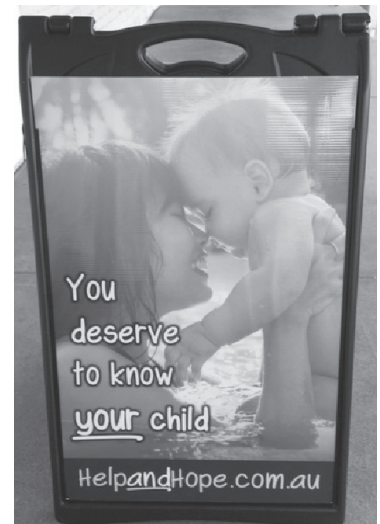
One of the signs displayed at 40 Days for Life prayer vigils