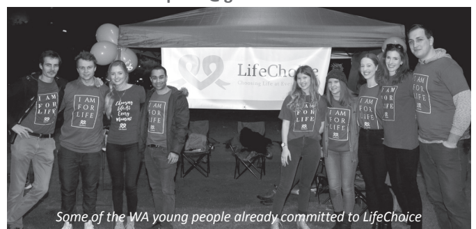
Some of the WA young people already committed to LifeChoice

If you are interested in being part of LifeChoice, please send an email to lifechoiceperth@gmail.com